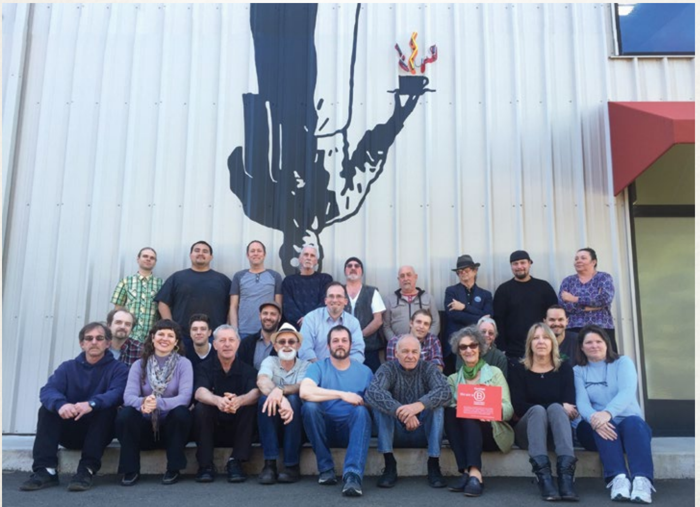
The Thanksgiving Coffee Company crew.